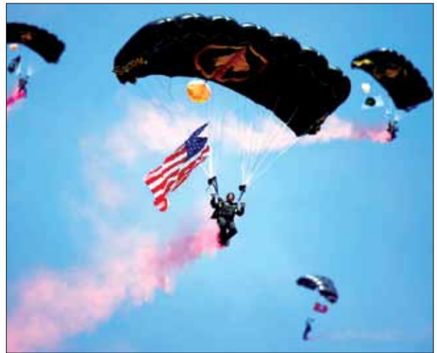
Para-Commandos, the parachute team, demonstrate their skills.

Air bursting MK285 pre-fragmented programmable high explosive ammunition was