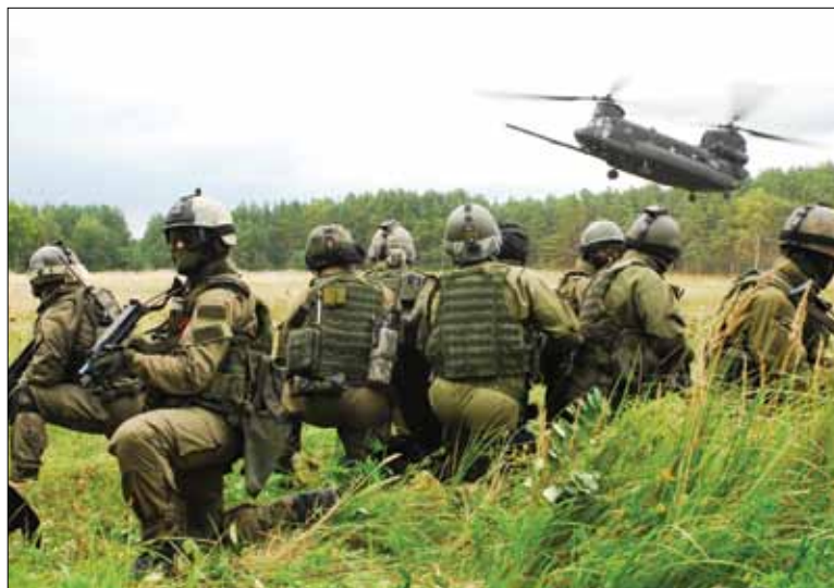
Coalition special forces wait for the MH-47G Chinook to land so they can extract their high value target.

U.S. Army Colonel Doug Rombough is the Program Executive Officer for Rotary Wing (PEO-RW). PEO-RW is responsible for providing the special operations forces community with the most advanced vertical lift capability available to the U.S. military. With the realignment of the preparation and training portfolio, rotary wing simulation has been fully incorporated into PEO-RW and enhances the PEO's ability to provide a complete capability to its primary customer, the 160th Special Operations Aviation Regiment (SOAR). PEO-RW has placed emphasis on rotary wing transformation, with the initial focus on commonality of plat-