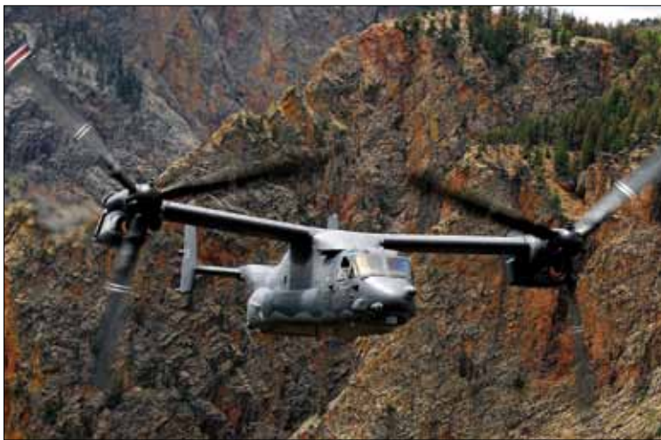
CV-22 Osprey in flight.

It enables armed over-watch and strike missions in addition to the current mobility and aerial refueling capability. PSP strike capabilities were demonstrated in 2009 as the JATF developed, integrated and tested the package using mature technologies. The expanded capabilities provided in the PSP include