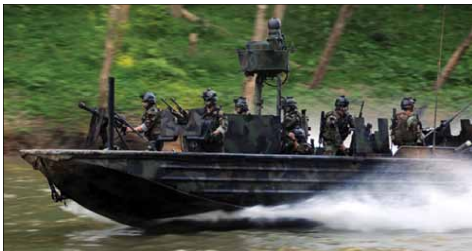
U.S. Navy special warfare combatant-craft crewmen from Special Boat Team 22 conduct live-fire immediate action drills at the riverine training range at Fort Knox, Ky.

Surface mobility programs are managed by both the Combatant Craft Program