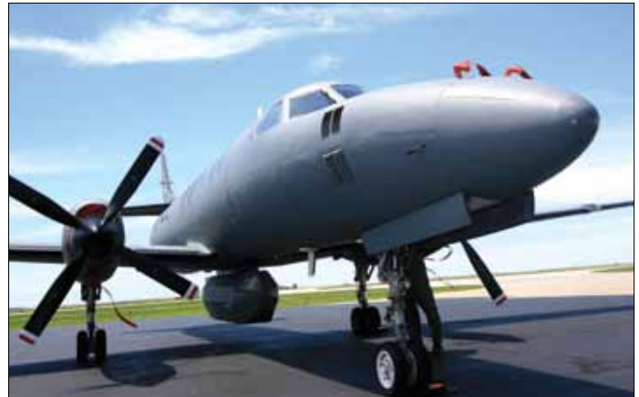
An RC-26B with the 130th Airlift Wing out of Charleston, W.V. is poised for flight.

mission-rehearsal actions are conducted in fully immersive "mock-up" systems that replicate the form, fit and function of the actual weapon system. The training environment includes three-dimensional views, computer-generated forces, synthetic communications, environmental conditions and sensory cues to train SOF warriors in the closest representation possible of the realities of combat.