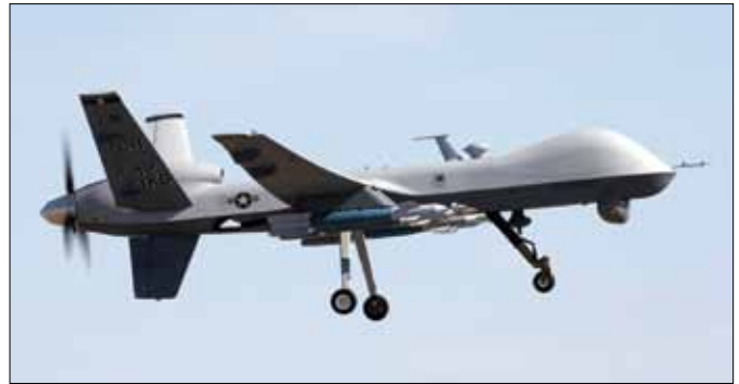
An MQ-9 Reaper flies above Creech Air Force Base, Nev.

The non-standard aviation (NSAV) mission provides dedicated intra-theater airlift and contractor logistics support (CLS) for the geographic combatant commander's theater special operations commands. The NSAV program delivers 21 light aircraft (11 Pilatus PC-12s and 10 M-28 Skytrucks) and 17 medium aircraft (Do-328s) to support command mobility requirements worldwide. All NSAV aircraft are modified with a common suite of military communications equipment. Light aircraft funding and deliveries began in FY08 and will continue through FY12. Of the 21 light aircraft, 10 PC-12s (including one trainer) have been procured and delivered to the 318th Special Operations Squadron at Cannon Air Force Base. NSAV initial operational capability was met when two of the PC-12s successfully forward deployed with full CLS in mid-2008. One M-28 was delivered to Cannon Air Force Base in late 2009, and four more were delivered in 2010. The remaining PC-12 and M-28s are scheduled to be procured and delivered between 2011 and 2012. The Do-328 aircraft procurement began in FY10. So far 12 aircraft have been contracted, and the last five aircraft will be contracted in FY12. The first Do-328 was delivered to the 524th Special Operations Squadron at Cannon Air Force Base in