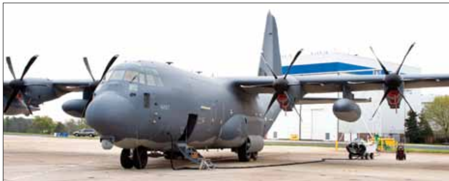
The MC-130J is to provide special operations forces infiltration, exfiltration, resupply and aerial helo refueling.

PEO-FW continues to face the mounting challenges of sustaining the low-density, high-demand SOF C-130 fleet while simultaneously satisfying roadmaps for modernization.