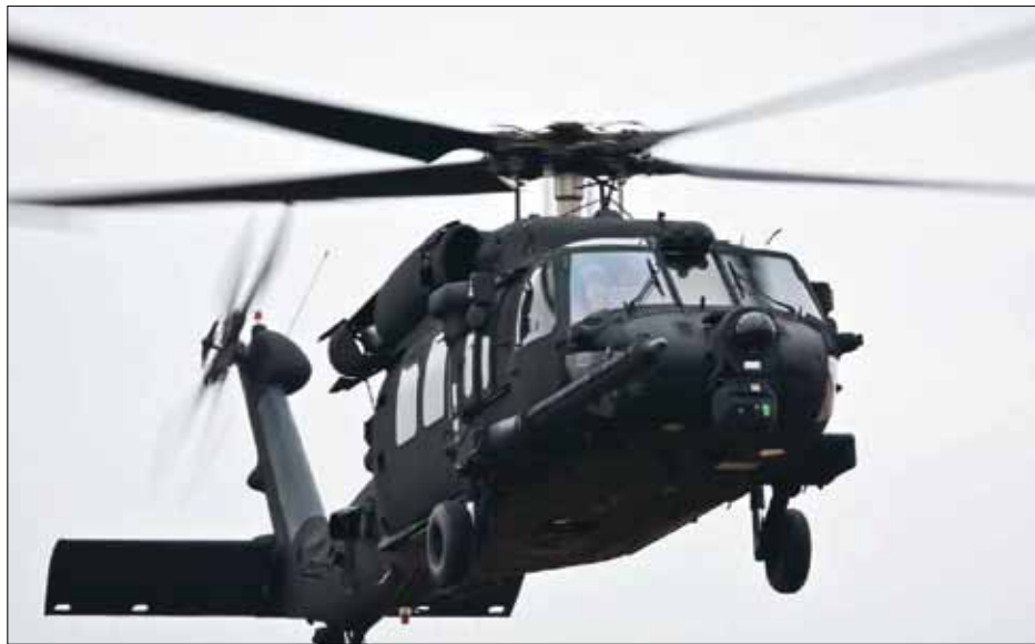
The new special operations MH-60M Blackhawk brings many impressive capabilities, including state-of-the-art day and night optics systems, enhanced integrated weapons systems, multi-mode radar with all-weather capability and new high-performance engines.

The non-standard rotary wing (NSRW) program facilitates the aviation foreign internal defense (AvFID) effort. It uses NSRW aircraft to conduct training with partner nations (PN) in support of U.S. strategic objectives. Core AvFID objectives are to train, advise and assist PNs in various areas of day and night operations. The primary purpose of these systems is to provide airlift, mission support and training where standard aircraft would not effectively support the SOF mission. The NSRW Aircraft Program Management Office, in concert with PEO-RW, will procure Mi-17 Hip aircraft in support of the AvFID mission performed by the Air Force Special Operations Command.