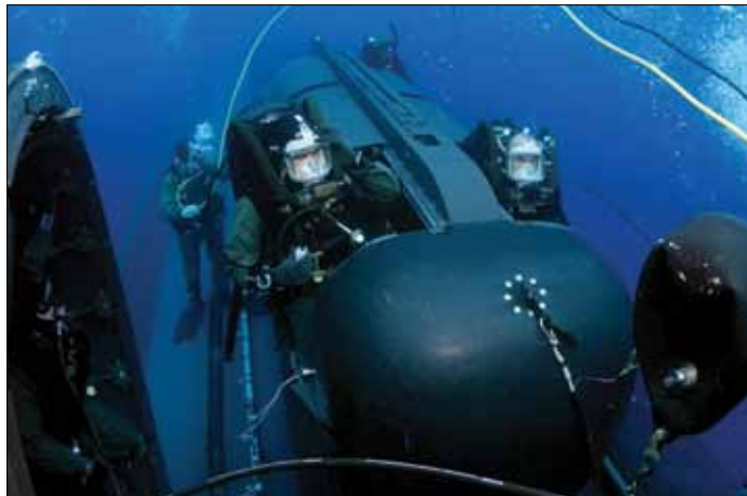
Members of SEAL Delivery Vehicle Team Two (SDVT-2) prepare to launch one of the team's SEAL Delivery Vehicles (SDV) from the back of the Los Angeles-class attack submarine USS Philadelphia (SSN 690) on a training exercise.

The SWCS program consists of a family of submersibles that includes a new wet submersible (SWCS Block I) capable of operating from existing DDS (and will replace the legacy SDV). Future submersibles may be wet or dry. They will be able to operate from future large ocean interfaces or surface ships, and they will provide the capability to conduct undersea missions in support of theater and national taskings. The primary method of launch and recovery will be from a DDS on board a host submarine, but alternative methods are available. The SWCS system