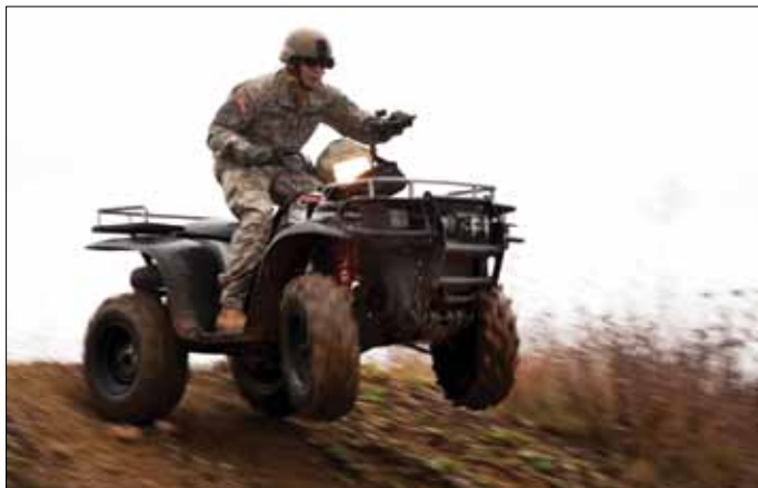
A U.S. Army soldier, from 1st Battalion, 10th Special Forces Group, trains on the advanced mobility course on an all terrain vehicle, in Boeblingen, Germany.

The focus is on rapid acquisition of capabilities that allow the SOF warfighter to successfully carry out the mission in a constantly changing environment. To enable rapid acquisitions, PEO-SW works closely with other government organizations, the services, and industry to leverage existing research and development and emerging capabilities. In addition, PEO-SW seeks efficiencies by using existing support infrastruc-