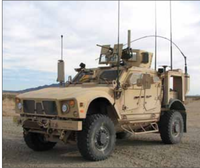
An M-ATV, the newest MRAP vehicle.

The GMV is a standardized joint SOF combat vehicle with the operational flexibility to support the SOF core activities of direct action, special reconnaissance, unconventional warfare, counterterrorism, security force assistance and counterinsurgency operations. The GMV is currently an M1165A1B3 high mobility multi-purpose wheeled vehicle with modifications that enable SOF operators to conduct unique missions. Current efforts include developing lighter weight solutions