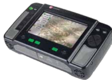
The L-3 Communications Rover hand-held unit provides comms on the move for special operators.

SOCRATES is the SOF extension of the Joint Worldwide Intelligence Com-